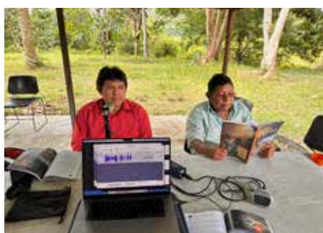
Recording in Venezuela